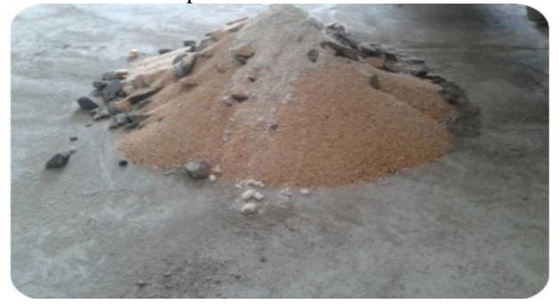
Fig.1: Sample of Marble powder

of marble waste which is 20% of total marble quarried has reached as high as millions of tons. This huge unattended mass of marble waste consisting of very fine particles is today one of the environmental problems around the world.